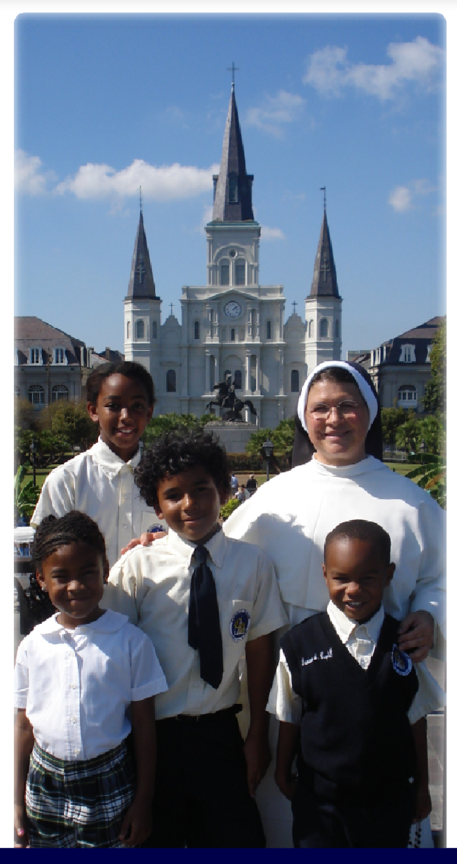
seeking truth and charity in a faith-filled environment